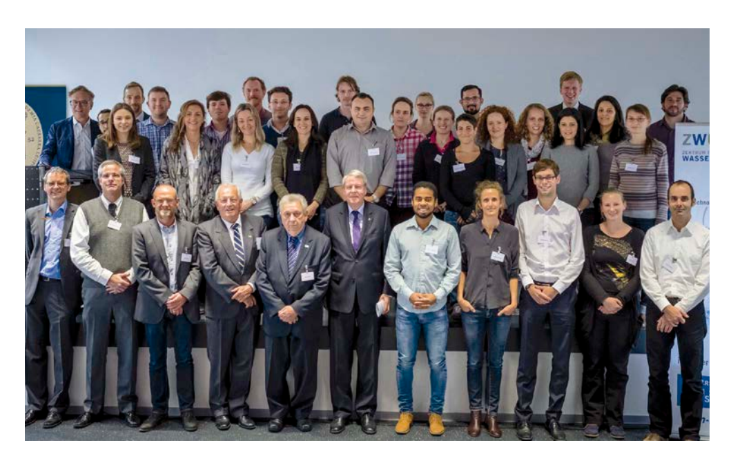
Image 4: The authoring group of young scientists, senior experts and academy representatives at the Workshop "How Do We Want to Live Tomorrow? Perspectives on Water Management in Urban Regions" from 4-7 October 2016 in Essen, Germany.