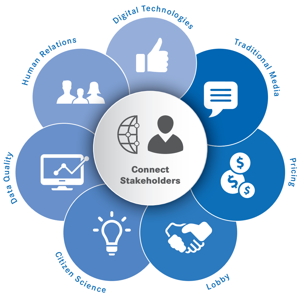
Figure 2: Connect Stakeholders