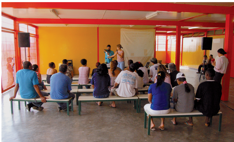
Image 3: In a community school situated in Parelheiros District (Municipality of São Paulo), graduate students from University of São Paulo present instructions related to dug wells sanitation, cesspits' ideal location, and cleaning steps for disinfection of wells, water storage tanks and drinking water.