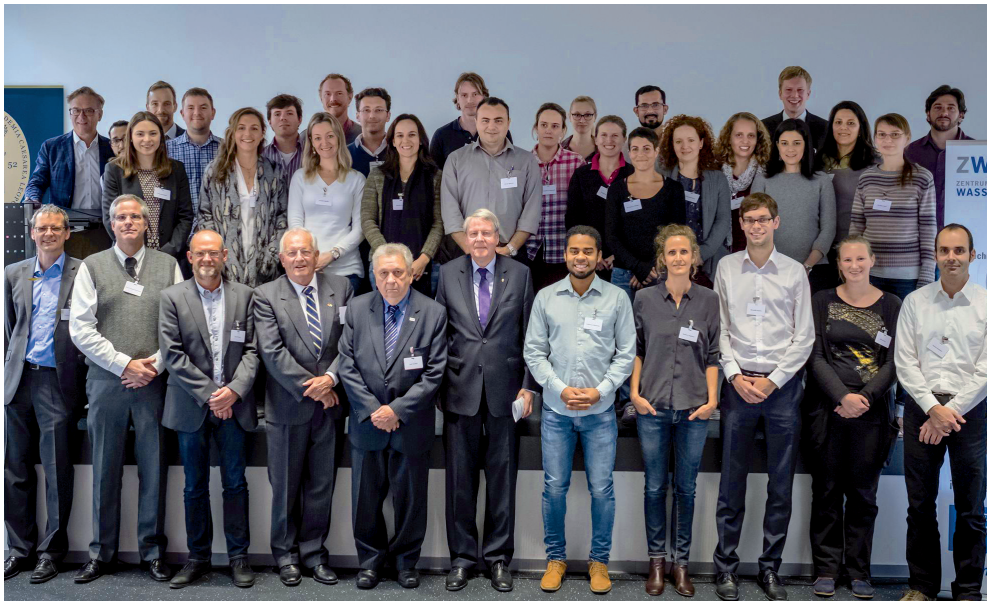
Image 4: The authoring group of young scientists, senior experts and academy representatives at the Workshop „How Do We Want to Live Tomorrow? Perspectives on Water Management in Urban Regions” from 4-7 October 2016 in Essen, Germany.