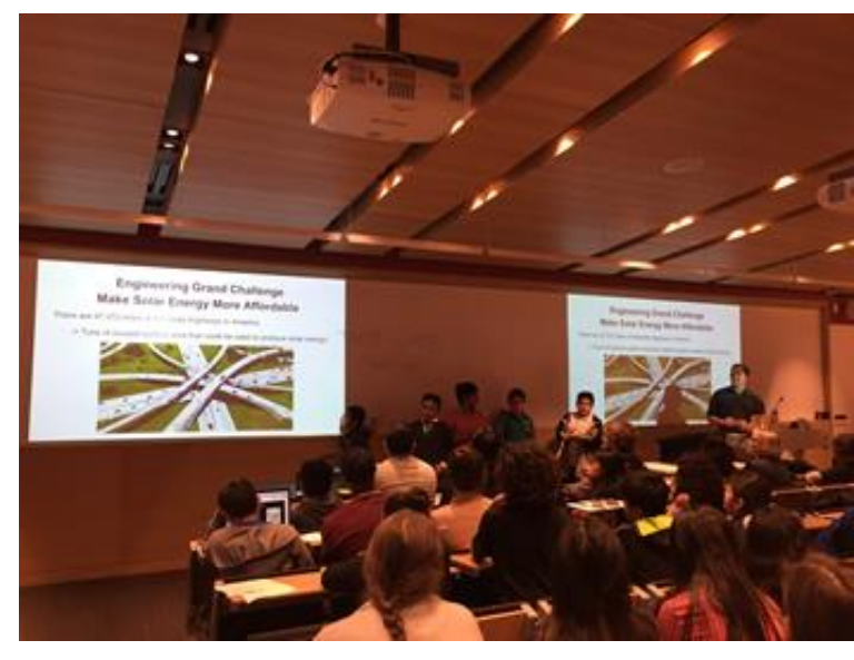
EXPOSE BROADER GROUP OF STUDENTS