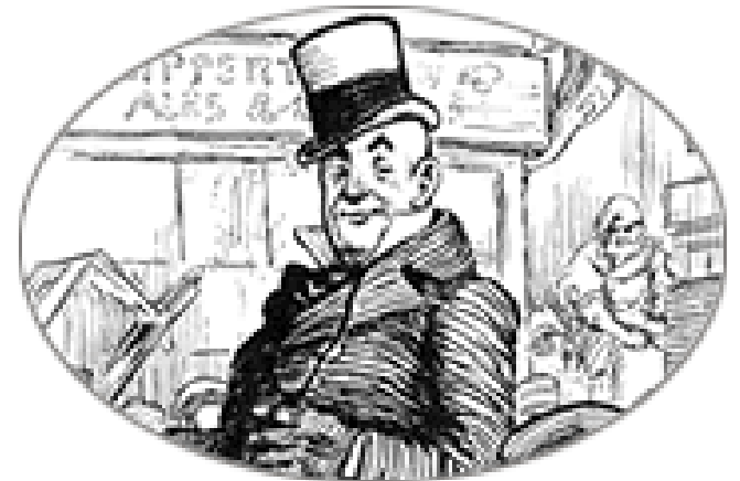
( Mr Micawber from David Copperfield )

Annual income twenty pounds, annual expenditure twenty pounds naught and six, result misery.