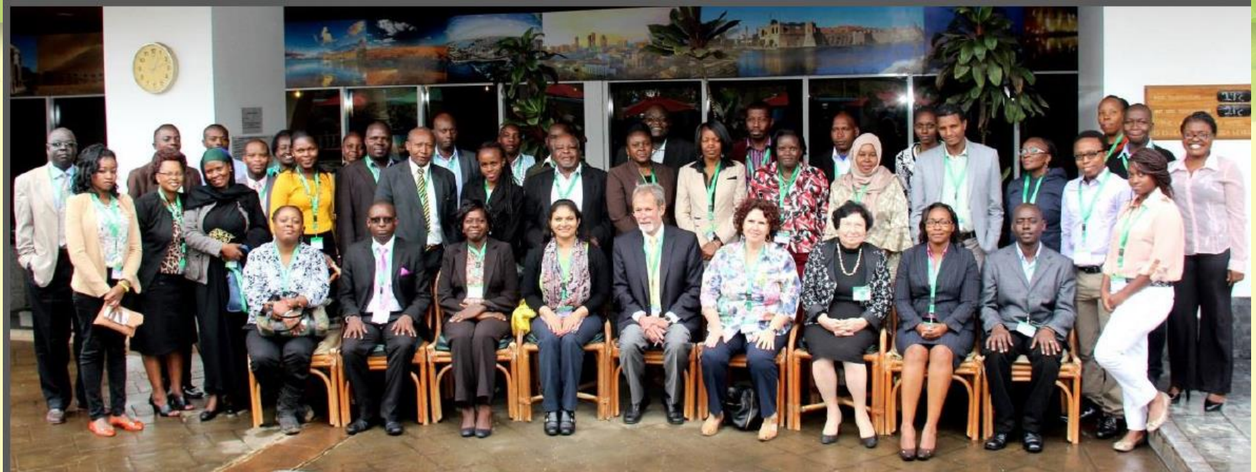
FACULTY AND STUDENTS IN NAIROBI